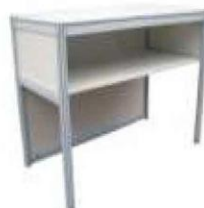
Information counter Code: PX-01 1030(L)X535(W)X760(H)