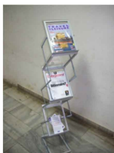
Brochure rack Code: AF-01 300(L)X300(W)X1100(H)