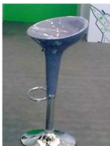
Barstool Code: BF-01 440(W)X480(D)X820(H)