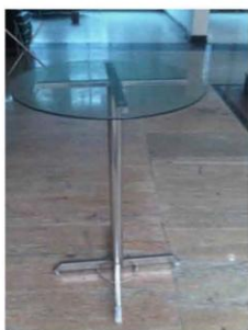
Cocktail table Code: TF-04 600(D)X1075(H)