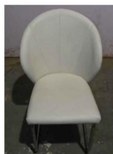
Barcelona Chair Code: CF-11 600(W)X550(D)X760(H)