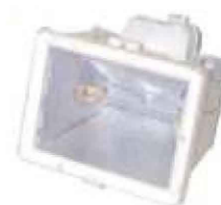
300W helogen flood light Code: LE-07