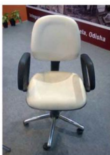
Executive Chair Code: CF-09 620(W)X500(D)X800(H)