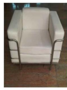
Sofa Chair with arm Code: SF-01 800(W)X750(D)X780(H)