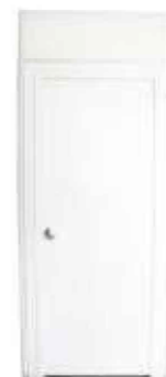
Lockable door Code: AS-03 :1000(L)X2440(H)