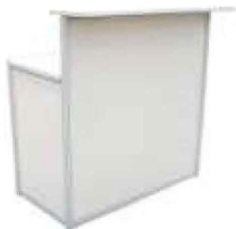
2-tier information counter Code: PX-07 1030(L)X535(W)X1030(H)