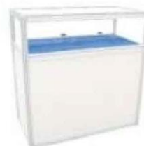
Small showcase Code: PX-02 1030(L)X535(W)X1030(H)