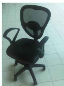
Office Chair Code: CF-10 650(W)X550(D)X800(H)