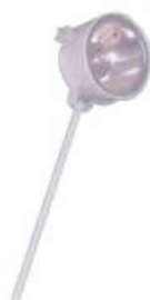
150W long arm helogen Code: LE-02