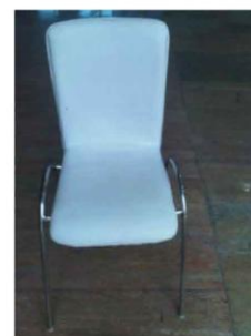
Leather Chair Code: CF-08 450(W)X450(D)X800(H)