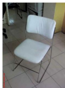
Standard Chair Code: CF-07 460(W) X 460(D)