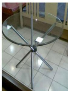
Round table Code: TR-01 850(D)X760(H)