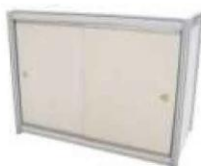
Lockable cupboard Code: PX-03 1030(L)X535(W)X760(H)