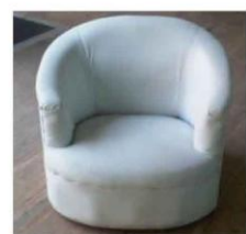
Vegas sofa single Code: LF-01 760(W)X440(D)X750(H)