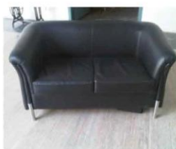
Vegas sofa double Code: LF-02 1290(W)X440(D)X800(H)