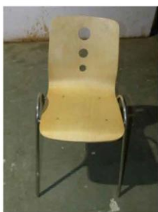
Wooden Chair Code: CF-03 440(W)X480(D)X820(H)