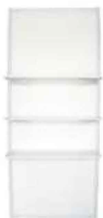
Shelf flat/ sloping Code: DS-01 1000(L)X300(W)