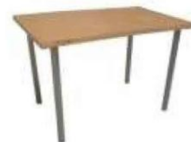
Meeting table Code: TF-02 1200(L)X900(W)X760(H)