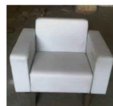
Sofa Code: LF-03 800(W)X750(D)X750(H)