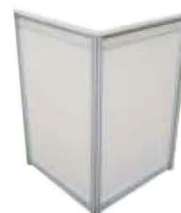
Display cube Code: PX-06 535(L)X535(W)X760(H)