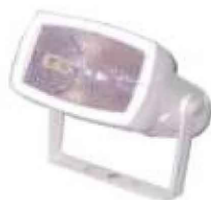
Metal halide 70w/150w Code: LE-08