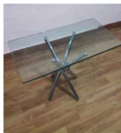
Coffee table Code: TF-01 450(W)X350(D)