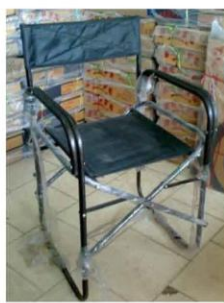
Folding Chair Code: CF-05 450(W)X460(D)X760(H)