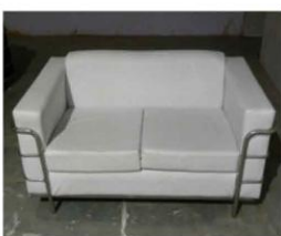
Sofa Chair with arm double Code: SF-02 1700(W)X750(D)X780(H)