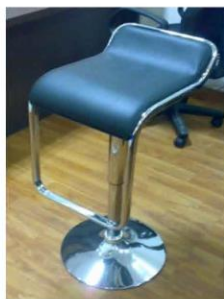
Barstool Code: BF-02 420(W)X400(D)X820(H)